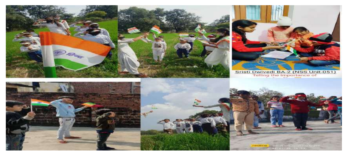
Mahatma Gandhi Martyr Day celebrated on January 30, 2022