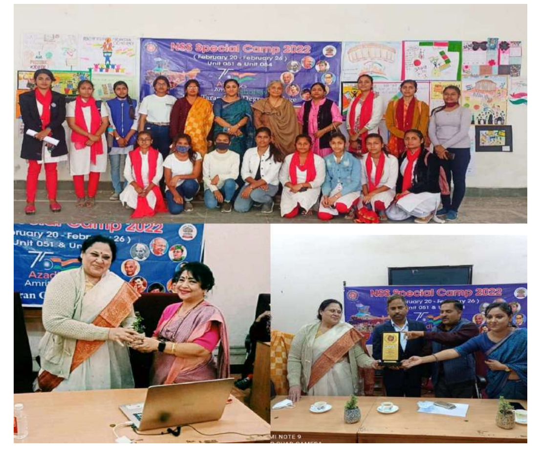
NSS Activities on February 23, 2022