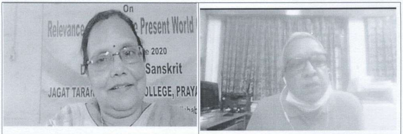
“International Webinar on Relevance of Yoga in the Present world Crisis” held on June 20-21, 2020