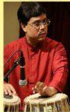
SHRI JYOTI PRAKASH RENOWNED TABLA ARTIST CALIFORNIA